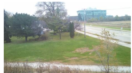
The location of the Ferry Forest Garden is on Ferry Road, near Hwy. 59.