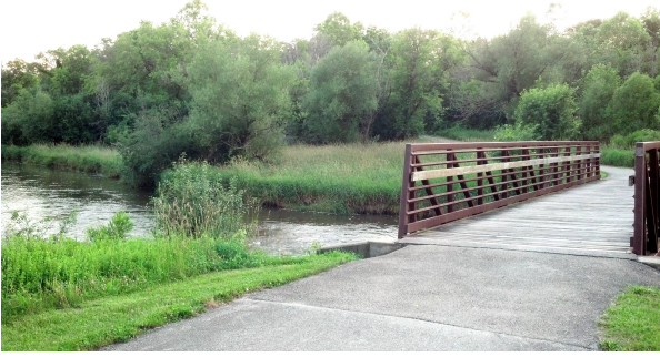
Path Geneva Spur - West Branch of the DuPage River

Welcome to the Illinois Prairie Path - a unique trail that winds through over 60 miles of rural and urban landscape. Thanks to the following people and organizations in Illinois and elsewhere who have supported the future of the Path by contributing in the past three months: